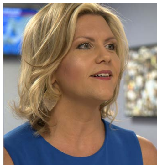
18 months after surgery