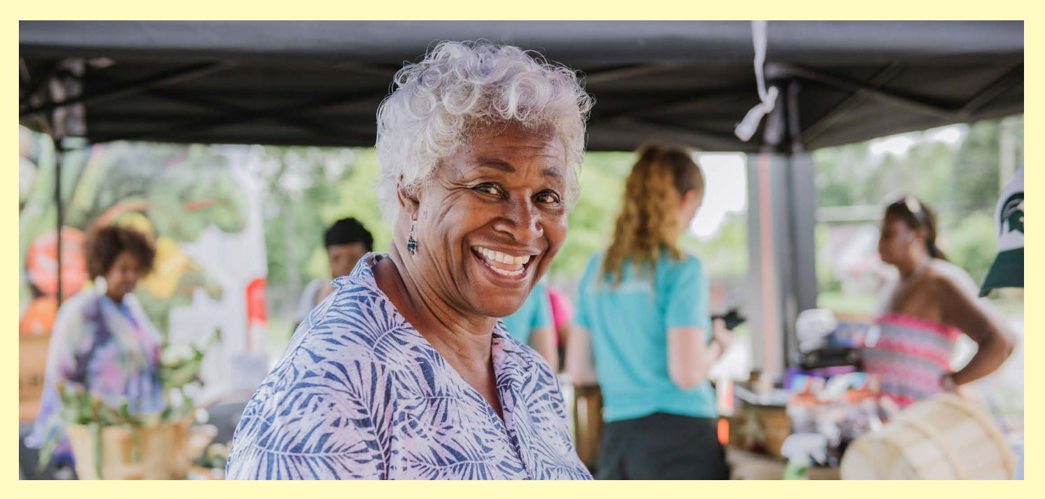
Farmers market shoppers can sample fresh fruits and vegetables and prepared dishes featuring produce selections, provided by Henry Ford food navigators.

Building on a strong foundation of farmers market food navigator programming, the grant enabled Henry Ford to connect with two farmers markets in Detroit: Northwest Detroit, led by the Grandmont-Rosedale Community Development Corporation, and Sowing Seeds, Growing Futures, led by the Joy-Southfield Community Development Corporation.