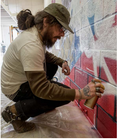
Murals on the inside and outside of Artblock surround and infuse the building with art. Fourteen local graffiti artists were commissioned to beautify the building.