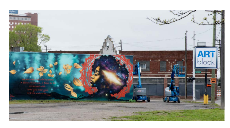
ArtBlock improves the streetscape and adds to the creative flavor of the Holden-Trumbull neighborhood.

To learn more or inquire about using ArtBlock for your group's next meeting or activity, visit <a href="henryford.com/">henryford.com/</a> artblock, email artblock@hfhs.org, or call (313) 355-3509.