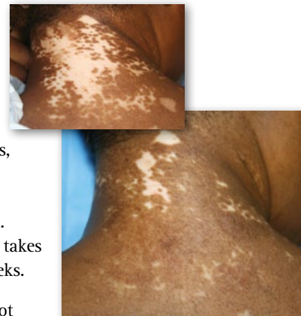
Improvement of generalized vitiligo six months after MKT procedure.

Melanocyte Keratinocyte Transplantation (MKT). In MKT treatment, a thin layer of unaffected skin is removed by dermatome; epidermal cells are harvested following trypsinization. The epidermal cell suspension, containing keratinocytes and melanocytes, is then applied to dermabraded vitiliginous skin. Repigmentation takes place in 3-4 weeks.