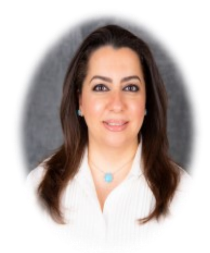
ACS Owen H Wangensteen Scientific Forum Excellence in Research Awards 2024

"The Effect of Lymphatic Microsurgical Preventive Healing Approach in Reducing Breast Cancer-Related Arm Lymphedema"