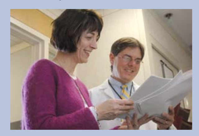
Colorectal Cancer Screening Recommendations