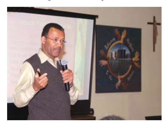
Cancer Prevention and Treatment Demonstration for Ethnic and Racial Minorities