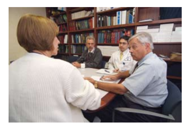
National Lung Screening Trial (NLST)

Funding: National Cancer Institute, National Institutes of Health