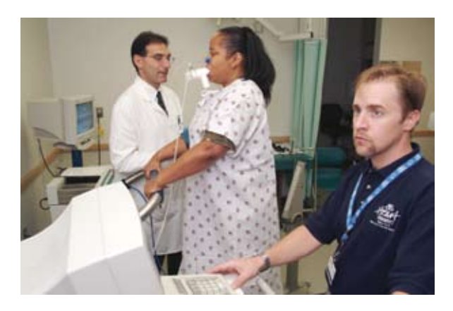
ACTION – A CHF (Congestive Heart Failure) Trial Investigating Outcomes of Exercise

Funding: National Heart, Lung, and Blood Institute, National Institutes of Health