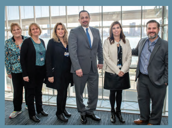
Recently the Ophthalmology leadership team attended the Henry Ford's All Leader meeting, an energizing day which showcased some of the upcoming changes planned for the health system.